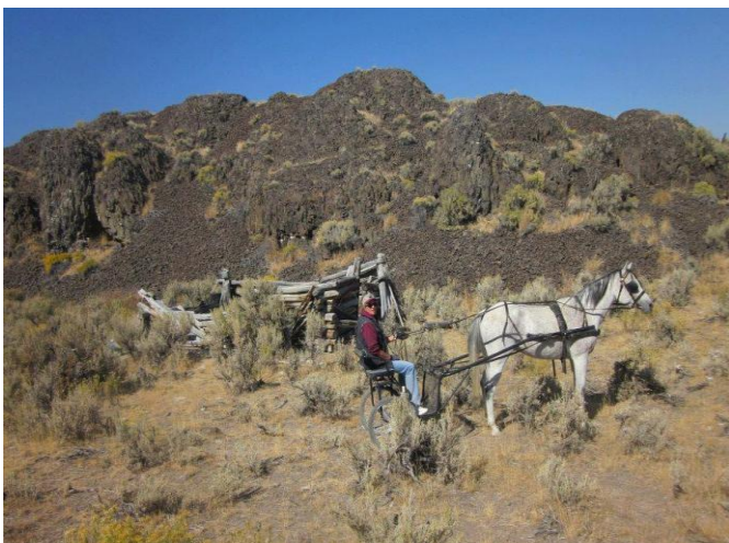
Christine Sword and Bandit

We had a wonderful turnout of 6 drivers, 5 passengers, 3 outriders and 2 helpers on our Owyhee adventure near Murphy, Idaho, on October 6 th . Our trusty steeds were 3 Morgans, 2 Arabians, 1 American Saddlebred, 2 grey Fjords, 1 mini, and a quarter horse.